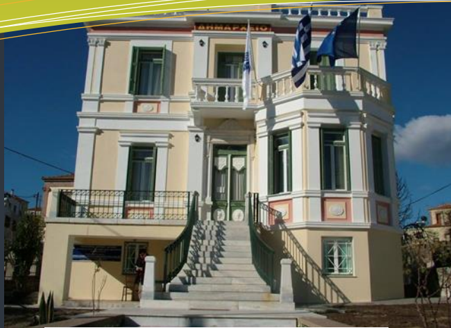
Town Hall of Mytilene